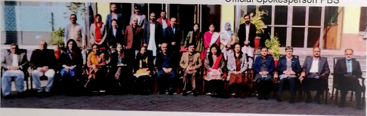
Group Photo of Participants of Orientation Session with National and International Organizations for conduct of 7 th Population and Housing Census- The Digital Census