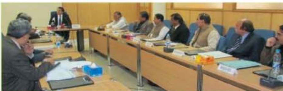
Minister of State for Finance, Economic Affairs, Statistics and Planning Mr. Saleem H. Mandviwala presiding over the meeting on the working of Pakistan Bureau of Statistics with special focus on Inflation (CPI) at Statistics House, Islamabad (21 December, 2012)