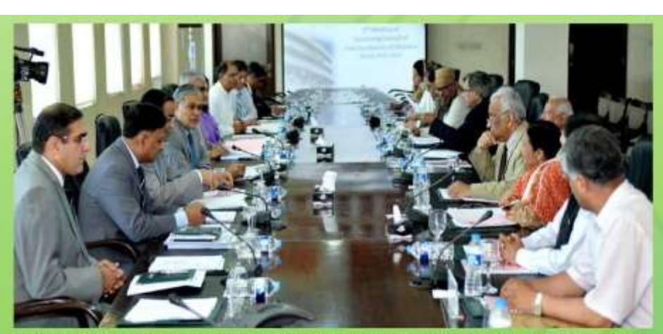
Federal Minister for Finance, Senator Muhammad Ishaq Dar chairing the 6th meeting of the Governing Council of Pakistan Bureau of Statistics at Ministry of Finance, Islamabad on May 26, 2014