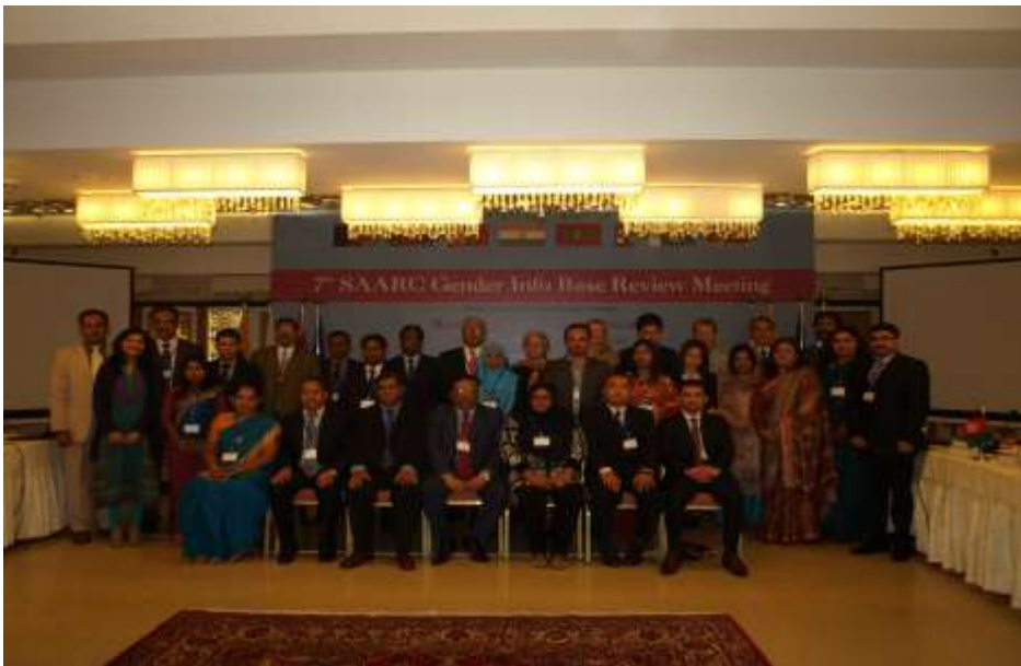
SAARC Gender Info Base Review Meeting