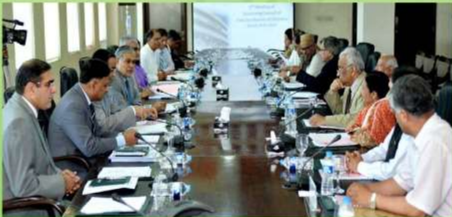
Federal Minister for Finance, Senator Muhammad Ishaq Dar chairing the 6th meeting of the Governing Council of Pakistan Bureau of Statistics at Ministry of Finance, Islamabad on May 26, 2014