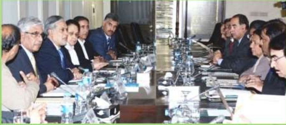
Federal Minister for Finance, Senator Muhammad Ishaq Dar chairing the meeting of Governing Council of Pakistan Bureau of Statistics in Islamabad on December 9, 2013