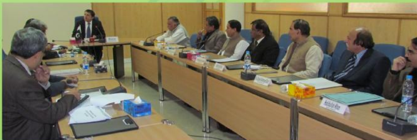
Federal Minister of State for Finance, Economic Affairs, Statistics and Planning Mr. Saleem H. Mandviwala presiding over the meeting on the working of Pakistan Bureau of Statistics with special focus on Inflation (CPI) at Statistics House, Islamabad

The Minister of State for Finance, Economic Affairs, Statistics and Planning during discussions appreciated the progress of various activities undertaken by the Pakistan Bureau of Statistics.